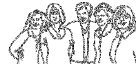
Trinity Women's Ministry

PDF Created with deskPDF PDF Writer - Trial :: http://www.docudesk.com